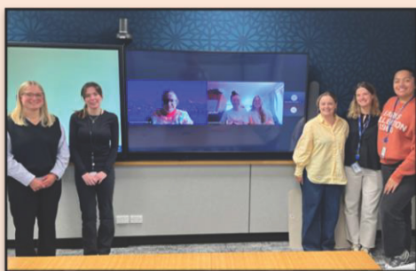
2024/25 Interns Christmas Quiz & Catch-up