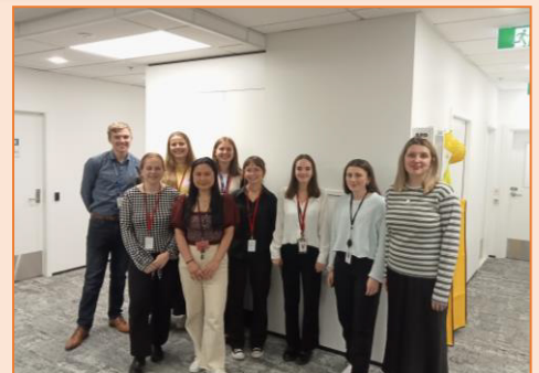
2022/23 Interns at Welcome