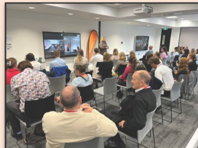
2023/24 Intern Farewell Ceremony