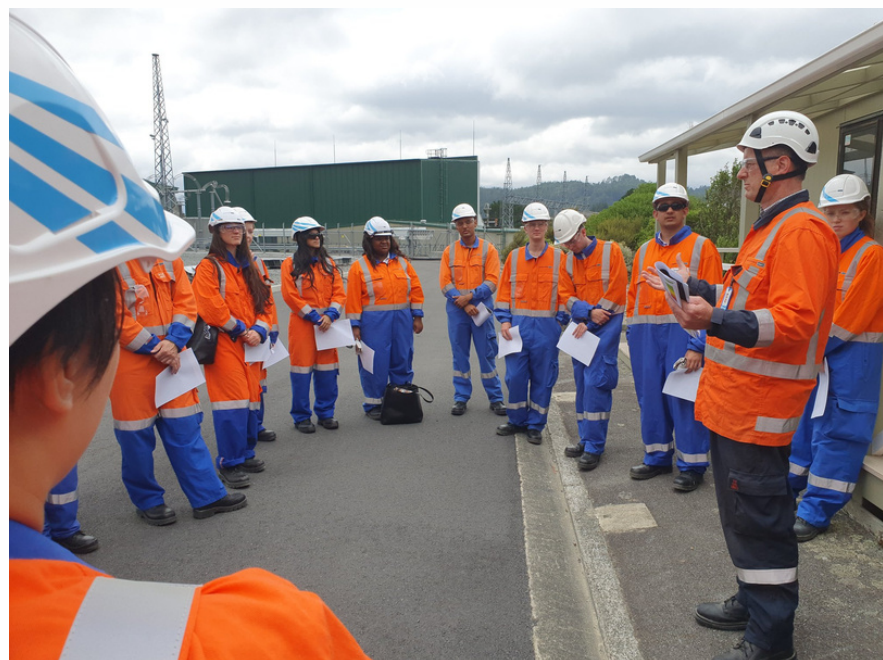
Intern event at Transpower's Haywards Power Station