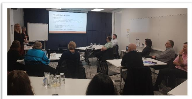
Wellington engagement workshop, July 2021

Work is now complete (pending final sign-off) and the new pathway will be launched in early 2022.